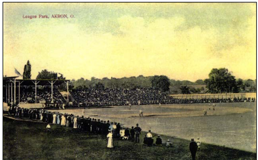
Postcard of League Park from Celebrating Akron in Picture Postcards published by The Summit County Historical Society in 2000.