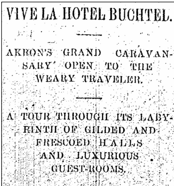
This advertisement appeared in the Summit County Beacon, March 19, 1884

The Windsor's efforts were in vain. Throughout the 1880s and 90s, the Buchtel Hotel enjoyed the reputation of being Akron's finest hotel. Later, people would remember the ceiling high mirrors, the mahogany, red plush, and horsehair furniture. It also had electric lighting, something the Windsor couldn't equal. The elevator was water-powered, and a ballroom across the street was connected to the hotel by an overhead bridge. It attracted a steady stream of well-known clientele. Even in 1899, the Buchtel was still touted as being able to provide accommodations "which none of the other Akron hostelries can furnish."