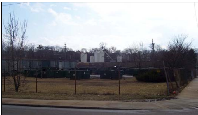
The corner of Carroll & Beaver streets today.

scrap. The grounds had been graded, more than 400 stalls for vendors had been put up and the whole area covered to a depth of 12 inches with cinders apparently to hold down the dust and mud. The new farmer's market opened for business on June 9, 1923 and operated as such through the 1976 season.