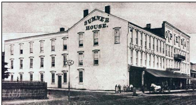
The Sumner House Hotel on N. Howard St. c 1870

times of the Panic of 1873. According to the Akron Daily Argus , all religious denominations represented “laid sanctimony aside, and had a good time.” Although destroyed by fire in 1876, the Sumner was rebuilt and operating again in 1878.