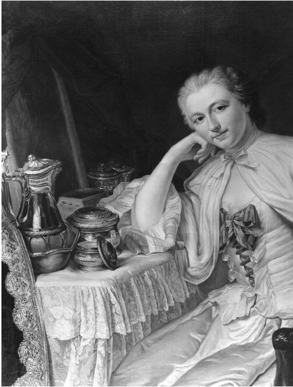
4.3. Rococo Painting with Dressing Table.