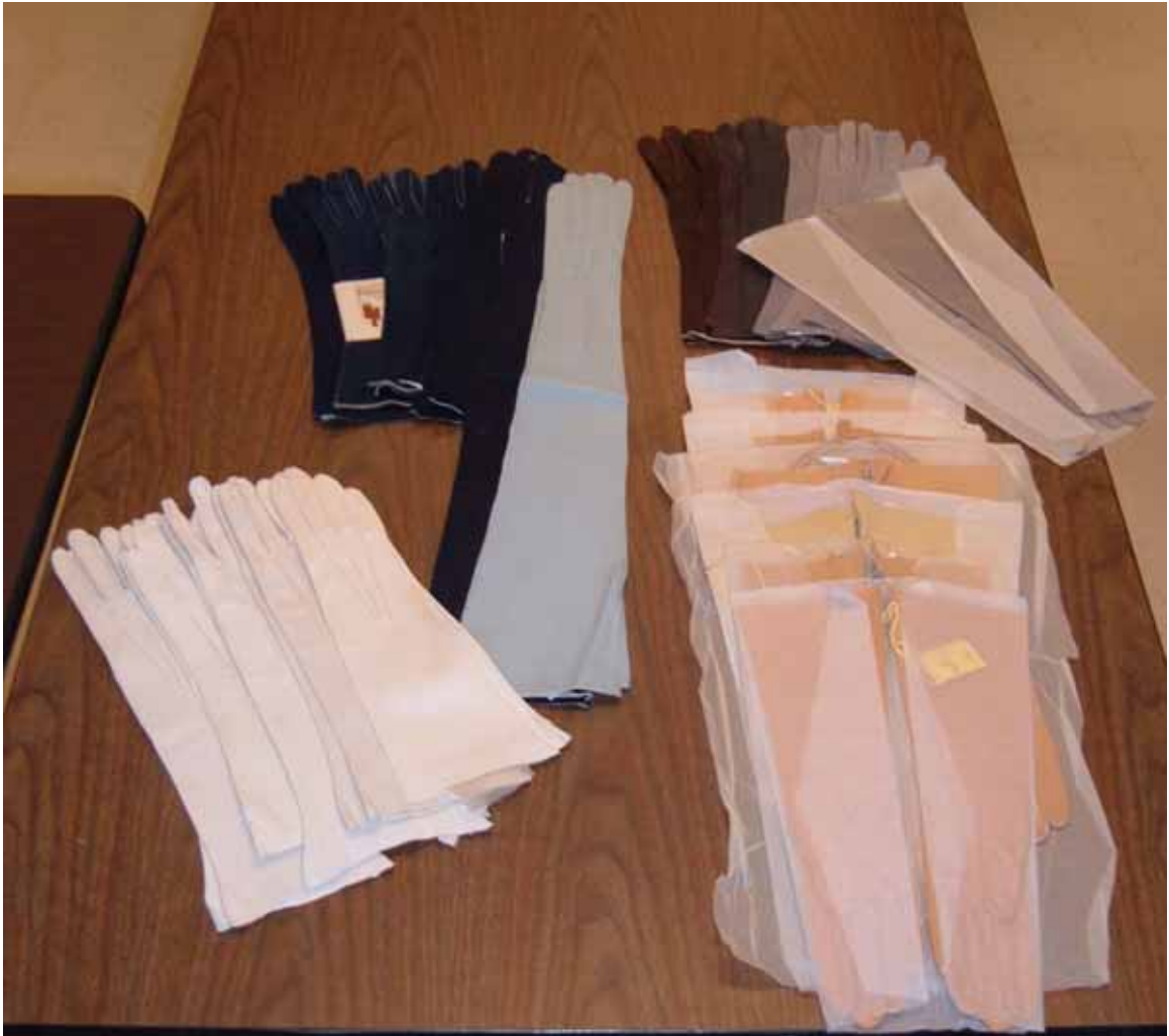
Figure 5.2. A Sampling of Gloves.

These gloves are a small selection from the collection.