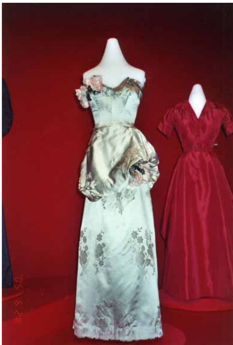
Figure 6-5. Salon Moderne Evening Gown. Photo taken at the “Vintage Couture: The Fashions of Elizabeth Parke Firestone” exhibition at The Henry Ford Museum on June 27, 2005.