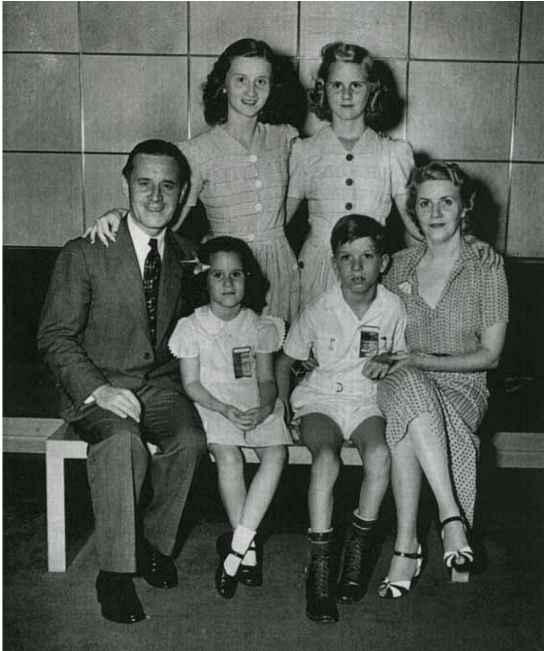
3.4. The Harvey Firestone Jr. Family. Casual photo of the family, circa 1939. Source: Firestone Collection, Accession #89.492.1697, Box 3, Folder 9, Benson Ford Research Center, Dearborn, MI.