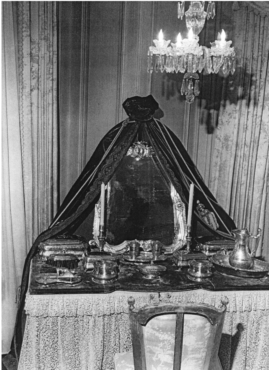
4.4. Dressing Table at Ocean Lawn.