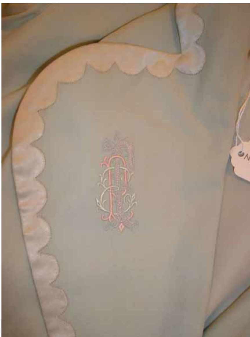
Figure 5.4. Dressing Gown with Monogram.