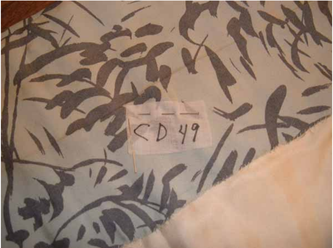
Figure 5.1. Example of Labeling System for Clothing. This item is a knee length skirt that has a matching blouse. Source: The University of Akron Elizabeth Parke Firestone Clothing Collection, Accession #1992.10.75B.