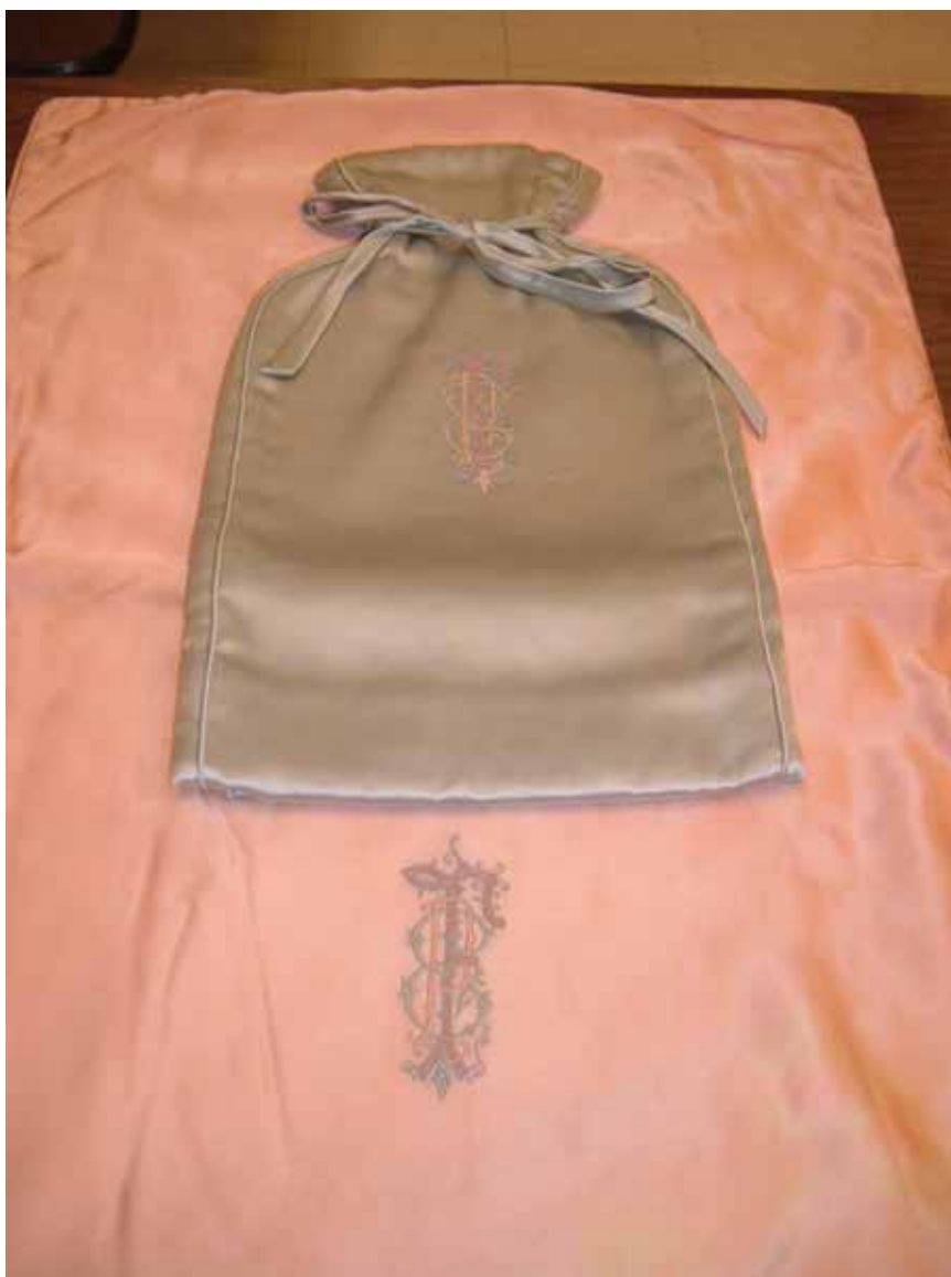
Figure 5.5. Lingerie Cover and Hot Water Bottle Cover.