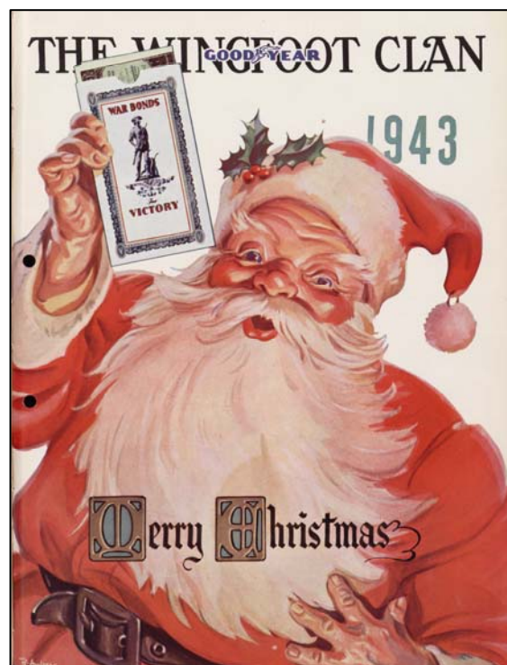
The cover of the December 22, 1943 issue of the Wingfoot Clan, Akron Edition promoted buying war bonds.

World War II era issues were also added to www.SummitMemory.org . Digital images were created from the film and loaded into the database. Each issue has been subjected to optical character recognition (OCR) software so it can be searched. Special Collections Division Manager, (continued on page 2)