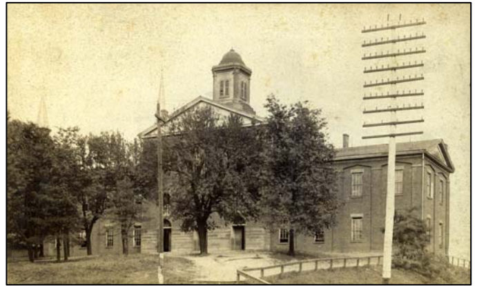
Jennings School c. 1890 at the intersection of Summit and Mill Streets.

ground floor and the primary grades in the basement. After the new high school was opened in 1886, the Jennings building was used strictly as an elementary school through the 1895 school year.