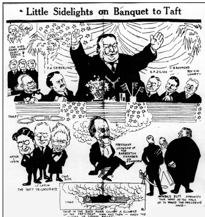
A cartoon depiction of the dinner sponsored by the Chamber of Commerce appearing in the Akron Press on February 1, 1912.