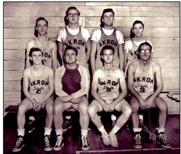
The Akron Silents were a semi-professional basketball team of deaf athletes.