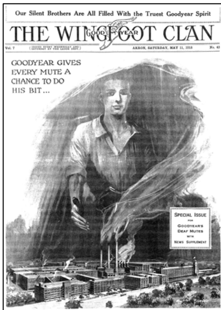
Cover of the May 11, 1918 issue of the Wingfoot Clan from www.SummitMemory.org .