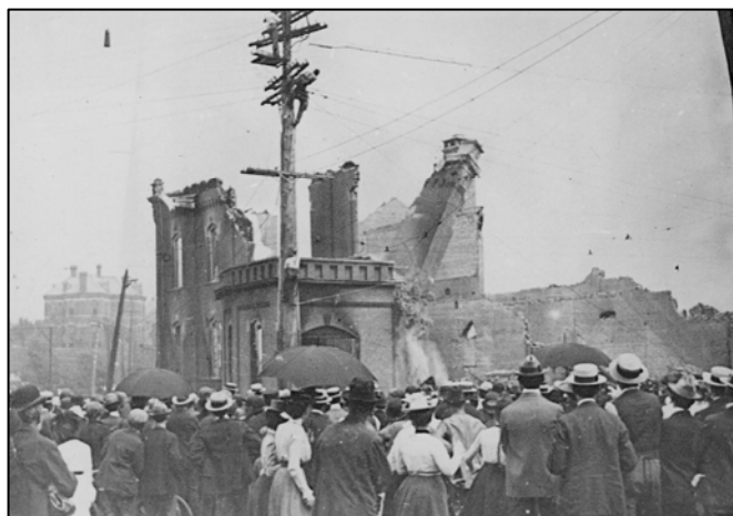
A crowd looks at the ruins of the Akron City Building on the corner of Main and Bowery Streets following the riot.

The total losses by fire from the damaged buildings in the riot came to $107,594.50. This included City Hall and its contents, Columbia Hall, and the J.P. Whitelaw building. All of the plats, records, and maps of the city's engineering department had been destroyed. No fire insurance was collected because of riot clauses in the policies.