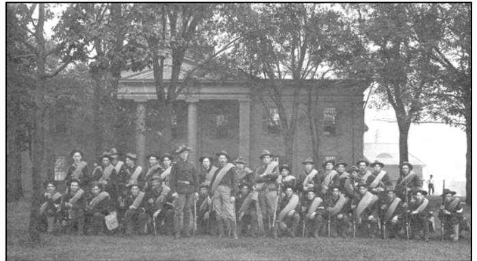
The 4 th Regiment of the Ohio National Guard responded to the Governor's call to occupy Akron in August of 1900.

saloons were to be closed so that the influence of alcohol would not be allowed to further cause any other crimes or uprisings.