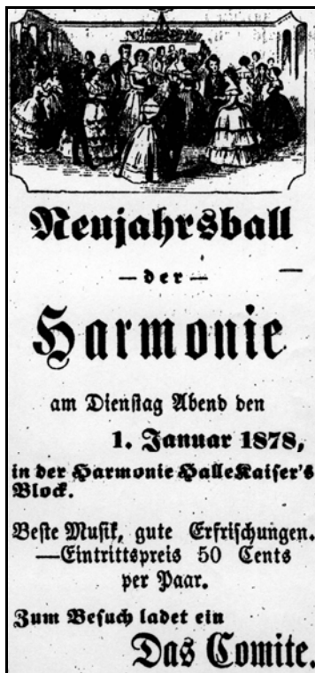
This advertisement for a New Year's Ball, promising "good music and good refreshments," appeared in the December 27, 1877 issue of the Germania, one of Akron's German language newspapers.

It is estimated that by the end of the 19 th Century, fully one third of Akron's population could speak German. There was even a need for German newspapers, the most prominent being the Akron Germania which began publication in 1868 and stayed in operation through 1925. In addition to the news of the day, the paper provided items of local interest as well as an advertising section catering to its readers. A typical example can be seen below.